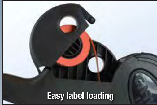
Easy label loading