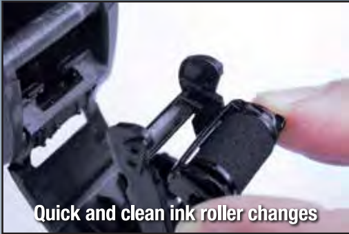
Quick and clean ink roller changes

With its easy and reliable operation, the Garvey 1910 labeler is the ideal tool for pricing, date coding, and batch numbering