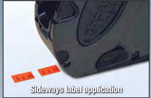
Sideways label application